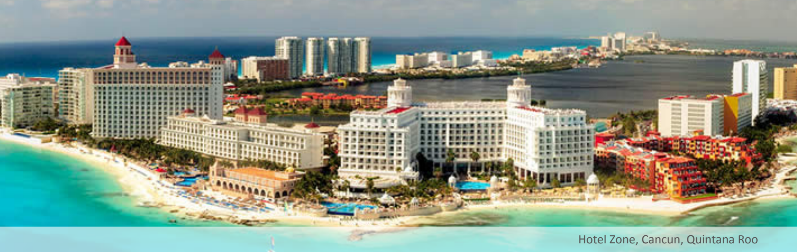
Hotel Zone, Cancun, Quintana Roo