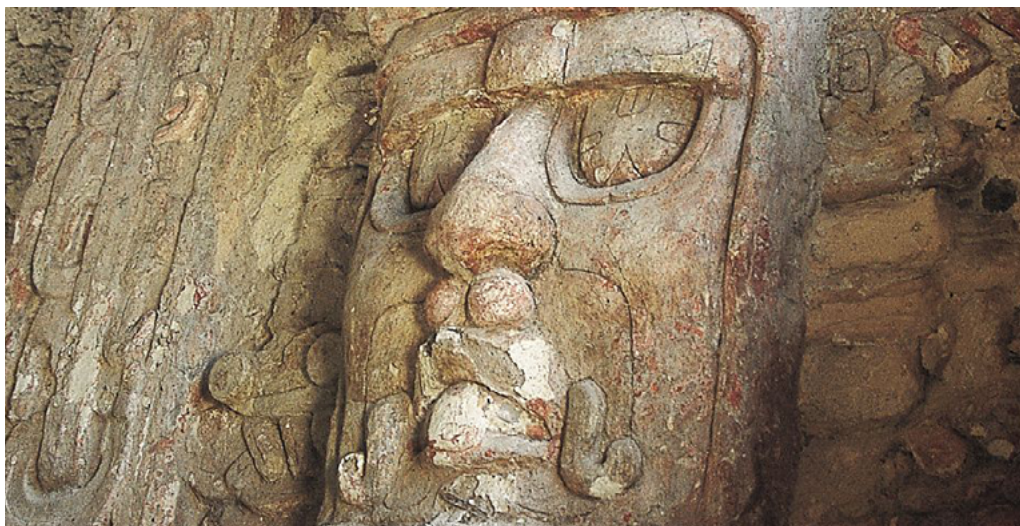
KOHUNLICH, Quintana Roo

The XVI World Water Congress under the overarching theme “Bridging Science and Policy”, is organized by the International Water Resources Association (IWRA), the National Water Commission of Mexico (CONAGUA) and the National Association of Water and Sanitation Utilities (ANEAS) will take place in the global water agenda at a decisive time, in face of the early stages of the 2030 Agenda and its implementation. The Congress takes into account the outcomes of the 7th World Water Forum held in Korea in 2015 and is a milestone towards the 8th World Water Forum to be held in Brasilia in 2018, focusing on the adoption by the UN General Assembly of the Sustainable Development Goals (SDG’s) and the COP 21 climate agreement.