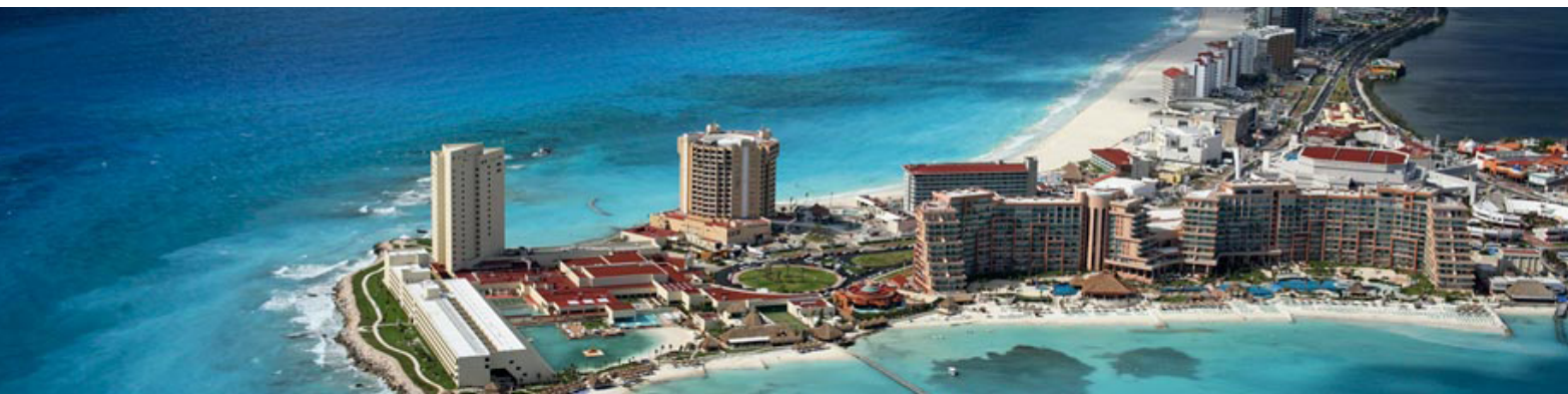
Coastal Area Cancun, Quintana Roo